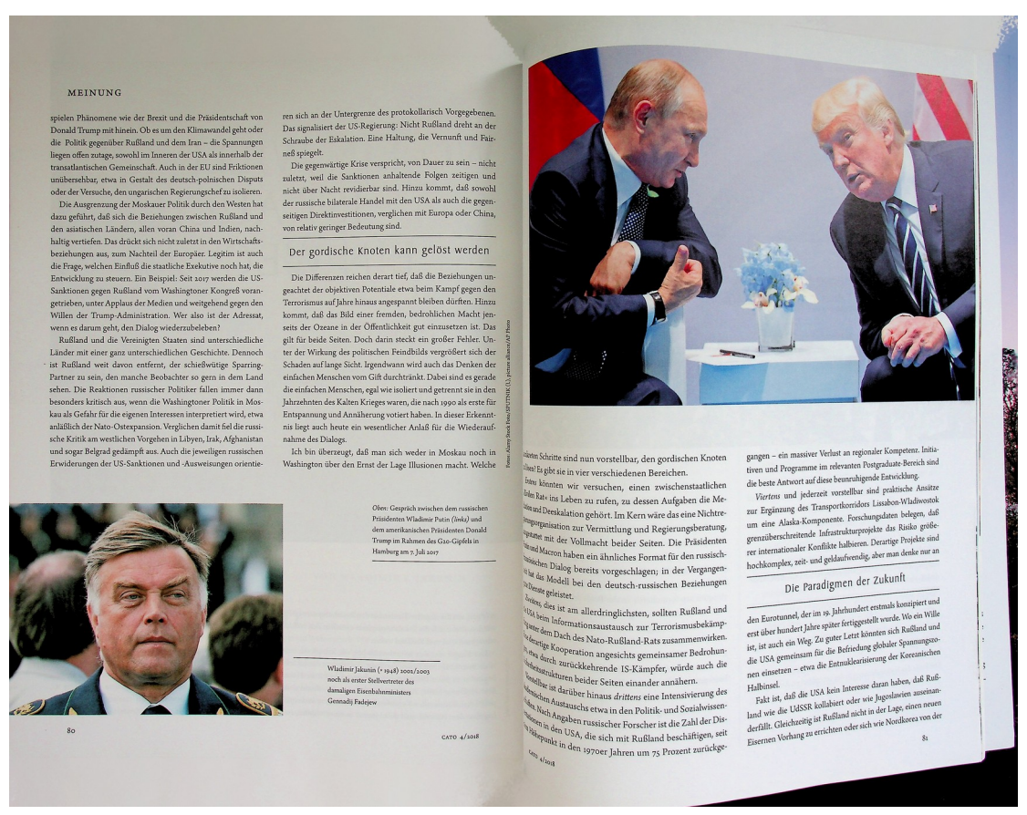
Fig. 4: Expectable conservative framing of political conflicts to be solved by powerful men and military power in German political culture magazine Cato 4 (2018), pp. 80–81.

Emotions associated with political reading are thus often related to personal experiences of political issues in everyday life; these experiences are processed, amplified, or exhausted by reading objects. Reader expectations are associated with designs that lend the information specific meanings and which have certain effects on evaluation, thereby re-formulating political issues into political narratives to either question or to follow. This becomes especially apparent in magazines like Cato , which presents political issues by a dominant right-wing political ideology, here by a conservative framing of the ongoing conflict between Russia and the United States, picturing a 'solution' which relies on powerful men, and military (Fig. 4).