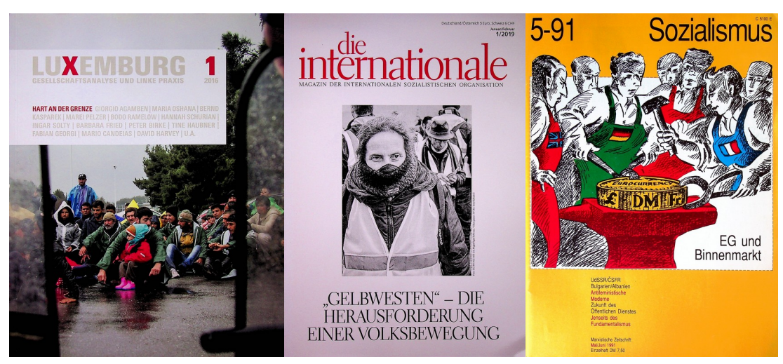
Fig. 12: Covers of German political culture magazines LuXemburg , die Internationale , and Sozialismus , which all follow socialist ideologies.

As typography is sensitive to contexts, its concrete patterns are not grammatically structured but reflect historical political ideologies or affiliations with certain political groups, communities, or movements, as can be easily seen by the cover figurations of LuXemburg , die Internationale , and Sozialismus (Fig. 12).<sup>79</sup> This also indicates that political reading practices are targeted by political agents, used in certain material constellations, modality combinations, content arrangement, or visual design, organizing not only political reading processes by legibility and readability, but also by orchestrating the interpretation of political issues between producer and reader<sup>80</sup> by way of affective design, e.g., by portraying politicians as heroes or villains,<sup>81</sup> or by valuing certain political decisions as seminal or dangerous. In this regard, typography also becomes crucial for attributions of authenticity and reliability, which some political communities acknowledge and some deny, legible in form and design.<sup>82</sup>