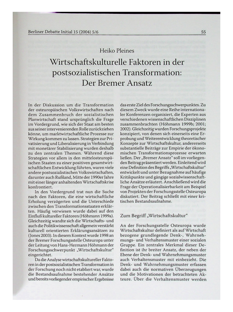
Fig. 1: Political content can be easily misunderstood, as can be seen in an article about post-socialism in German political culture magazine Berliner Debatte Initial 15 (2004), issue 5/6.

Necessary literacies are thus based on more elaborated forms of reading skills: comprehension of complex political issues and deliberatively building political opinions require skills like abstraction, reflection, distancing, and critical thinking.<sup>29</sup> Political reading likewise differs in terms of the outcomes of information and persuasion reaching target audiences characterized by a capacity to comprehend not only political content, but also the ways in which content is presented by its usable objects.<sup>30</sup>