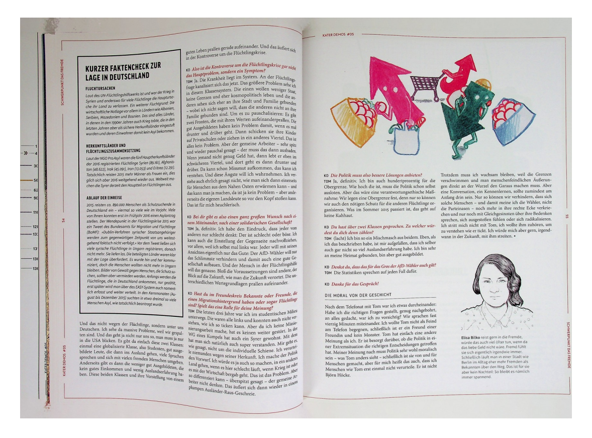
Fig. 2: Non-linear arrangement of political content on a double-page spread in discontinued German political culture magazine Kater Demos 5 (2018), pp. 54–55.

One common feature of political reading objects in this regard is their non-linearity, allowing readers freely to choose what to read or not to read, and to read in the order they prefer.<sup>31</sup> Although political reading processes may occur in a linear fashion, as is the case when reading a written political text from start to finish, it is non-linear modes, skimming through political reading objects and content, and hybrid modes of reading, alternating continuous and discontinuous reading processes, that are the dominant political reading practices, ambiguously supported by the materiality and visuality of political reading objects.<sup>32</sup> Political reading objects usually offer many political content elements at once, within any particular article, in the incorporation of several articles on any given page or two-page spread, and in each issue. This is exemplified in this spread from Kater Demos (Fig. 2), which shows several reading elements: interview questions and answers marked by color, a resumé marked by a headline, a frame-lined text on the left with another three separate textual units marked by bold headlines, an illustration, and a short biography with graphical portrait of the interviewee.