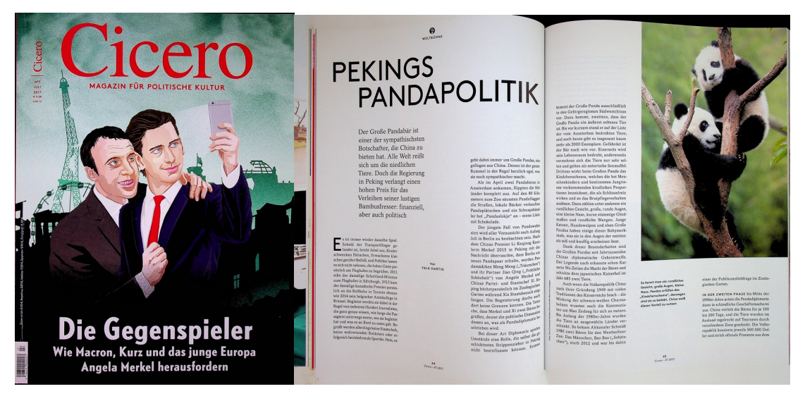
Fig. 9: Cover of German political culture magazine Cicero 7 (2017) and a picture of pandas on pp. 64–65, both used for an affective connotation of either issue or article).

related to an unconstrained typeset which then lingers in maximal contrast to the written text's negative political portrayal of China (Fig. 9)