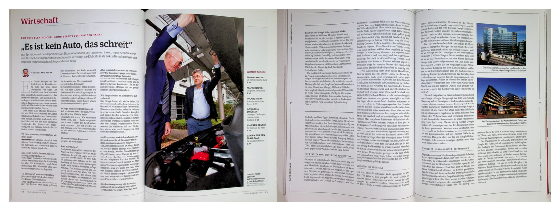
Fig. 11: Initiation of erratic reading by salient visual elements in German political culture magazine Tichys Einblick 11 (2016), pp. 52–53 (left), and free reading inspired by images without hierarchies in German political culture magazine Kater Demos 3 (2016/2017), pp. 70–71 (right).

and understanding political issues; erratic reading, led by salient elements ('ideological' reading) for political persuasion; and free reading ('interactive' reading) for political information related to interest (Fig. 11)