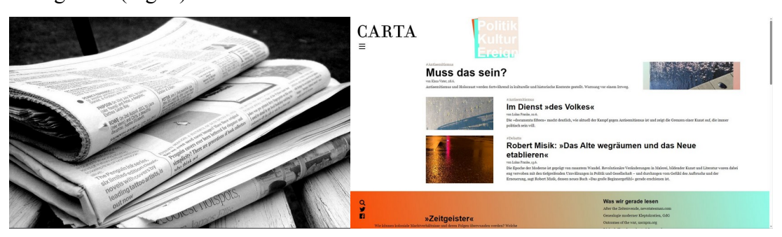
Fig. 5: Certain reading artifacts by presence and affordance are unconsciously identified as political reading media, here printed newspapers, or the political blog Carta , and anticipate a political way of reading.

The underlying, but not elaborated meaning of political reading objects in political communication can be further developed by considering their materiality, opening up a range of sensibilities in political reading practices. This requires understanding political reading media as intermediate states of political communication, in which political information, persuasion, and activation are negotiated through technical, material, visual, and semiotic means. Political reading objects then are always read (and used) as material and interactive political reading artifacts, partially enabling, organizing, or restricting mental activities of political communication. Political reading artifacts thereby act as powerful affordances and performative physical presences, which identify their content as political in nature, inviting the adoption of certain perceptual modalities and physical activities, and anticipating certain expectations relating to design, the reading processes invoked, and the gratifications to be gained (Fig. 5).