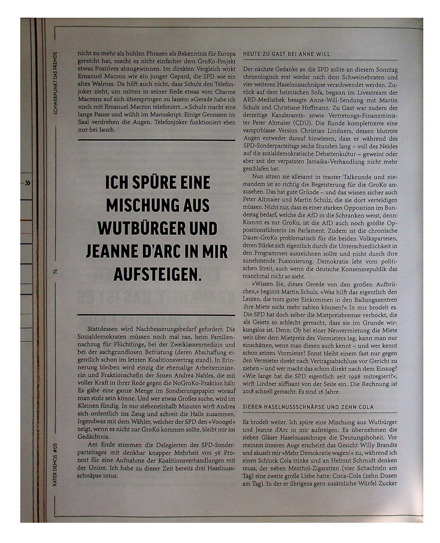
Fig. 10: Fonts used in Kater Demos 5 (2018), p. 76.

In its spatial configuration, typography first suggests reading sequences and hierarchies of the modalities used. Variations may then be used for initiating certain reading strategies for the political information presented, directing comprehension and salience. In contemporary political culture magazines, usually two typefaces are used, one (most often sans serif) for paratextual elements and one (most often renaissance or classical Antiqua) for running text, both aiming at maximizing legibility and readability. In Kater Demos , an upper-case sans serif typeface in bold markup is used for highlighting statements, suggesting reading strategies by attention created and salience of content elements by connotations of importance and weight. The renaissance Antiqua used for running text in comparison has fewer obvious connotations other than appearing a standardized font for maximum legibility and readability (Fig. 10). Reading strategies then include sequential deep reading guided by organizing visual elements ('bookish' reading, see Fig. 7) for gaining insight into