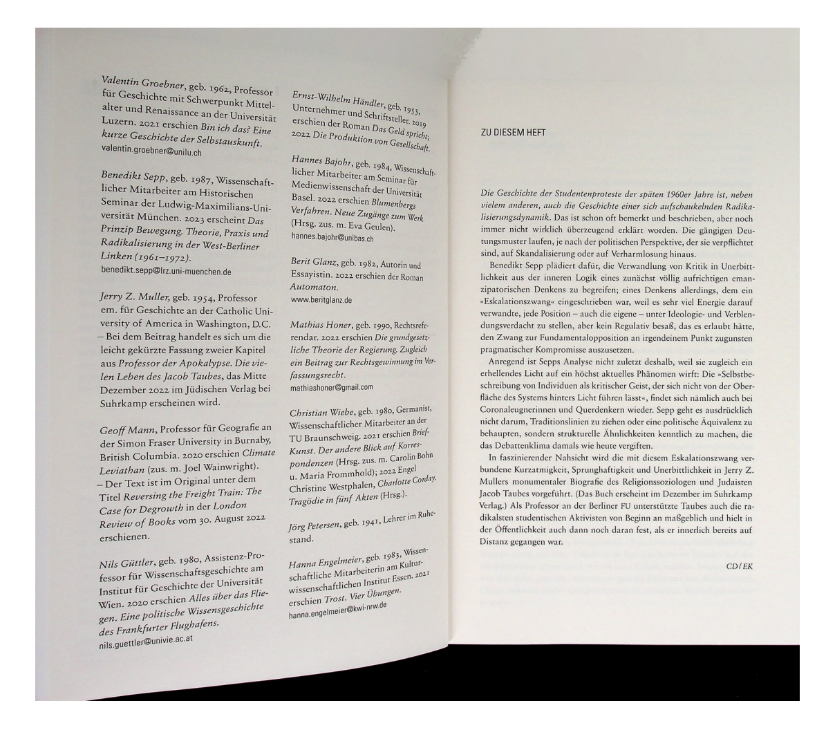
Fig. 3: Typical paratextual elements to induce attributions of professionalism and expertise in German political culture magazine Merkur 76 (2022), issue 882, pp. 2–3.

(2) In comparison, discursive political reading strategies<sup>37</sup> emerge when a reader is trying to build or confirm an opinion about political issues, and when expanding informational reading strategies by reader dispositions. These strategies are structured in such a way as to individually (re-)construct political interrelations, arguments, opinions, and suggestions, with the effect of drawing individual conclusions regarding political identity and activities. Incorporated reading strategies then involve affective activation, imagining what-if scenarios and alternatives, and distinguishing one's own political ideation from other political opinions, ideologies, movements, organizations, etc. Reading objects are then primarily used for experiencing emotions, moods, and attitudes for the sake of consolidating political identity, being a part of a political community, or becoming involved in certain political activities like elections, debates, protests, or revolutions.<sup>38</sup>