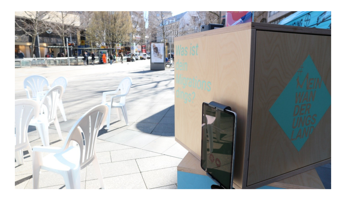
Fig. 5: Multimedia-Station