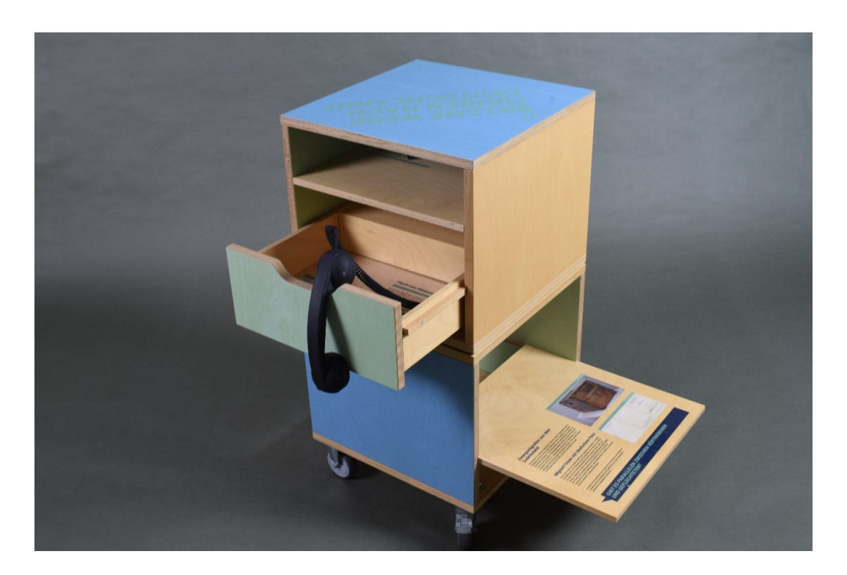
Fig. 1: Cube with listening station

tive out of it, i.e. contract workers in one drawer and guest workers in the other, and then emphasized the similarities in each case."<sup>87</sup> This highlights a critique of the frequent focus on migration in West Germany in the exhibitionary complex of migration.