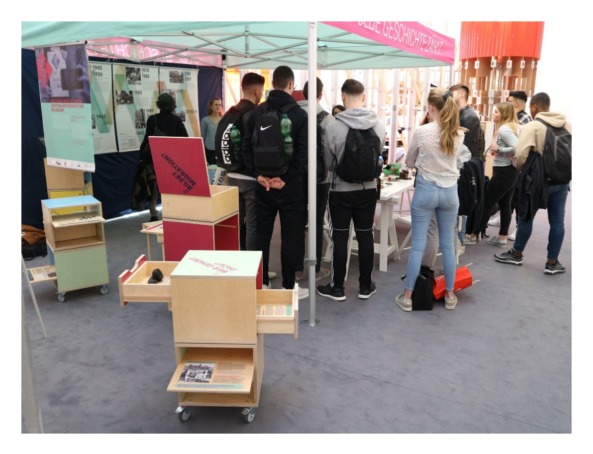
Fig. 3: Insight into the exhibition and narrative platform

Meinwanderungsland narrated migration not only as a self-evident phenomenon of (urban) society but also as characterized by racism and colonial violence as part of migration history. This can be seen in the accompanying program in many events, workshops, the transcultural and postcolonial city tours, and eyewitness talks. 92 The position was: "It is quite clear that you cannot and should not avoid the topic of racism when you tell the story of migration."93 A practical example of this context can be found in the educational materials produced in the course of the project. In the school workshop "Learning with Objects—Understanding Racism," the project staff used a socio-critical approach to address a younger generation. The workshop's goals —to "develop social empathy; empower those affected or themselves; develop solidarity and a sense of community; strengthen self-responsibility, civil courage, and democratic participation, and thereby facilitate participation in social life"95—further demonstrate the actors' socially transformative agenda. With the help of a wide variety of materials from the DOMiD collection, they attempted to convey the topic to the students in a way that is relevant to everyday life, central to which is a socio-critical attitude that seeks to stimulate the dismantling of stereotypes and prejudices to pro-