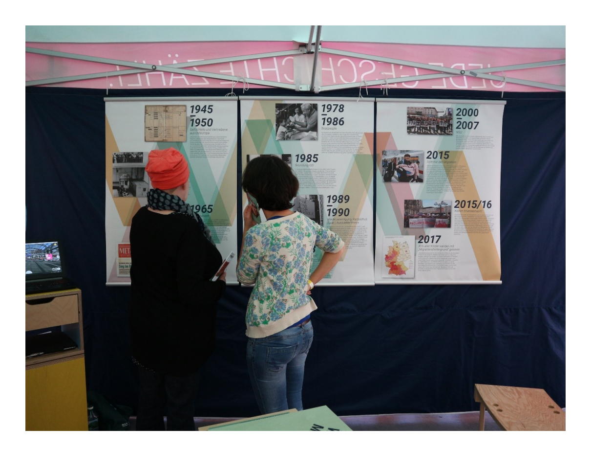
Fig. 2: Chronology

A table with objects and photos of objects of everyday migrant life made it possible to engage hands-on with the 'materialities of migration' and with connected migration biographies. 90 These ordinary objects, such as an old camera or shoes, were loaned by migrants who also participated in the stories told about them here. The 'counter-chronology' and the object work clarified the central position of migrant-situated knowledge. The aim, not only to translate scientifically elaborated or published knowledge but to center migrant-situated knowledge, was achieved by telling the stories of the lenders and not finding scientific papers about the objects. This perspective is a rejection of positions in public debates on memory politics that discuss migration as a problem and a new phenomenon. 91