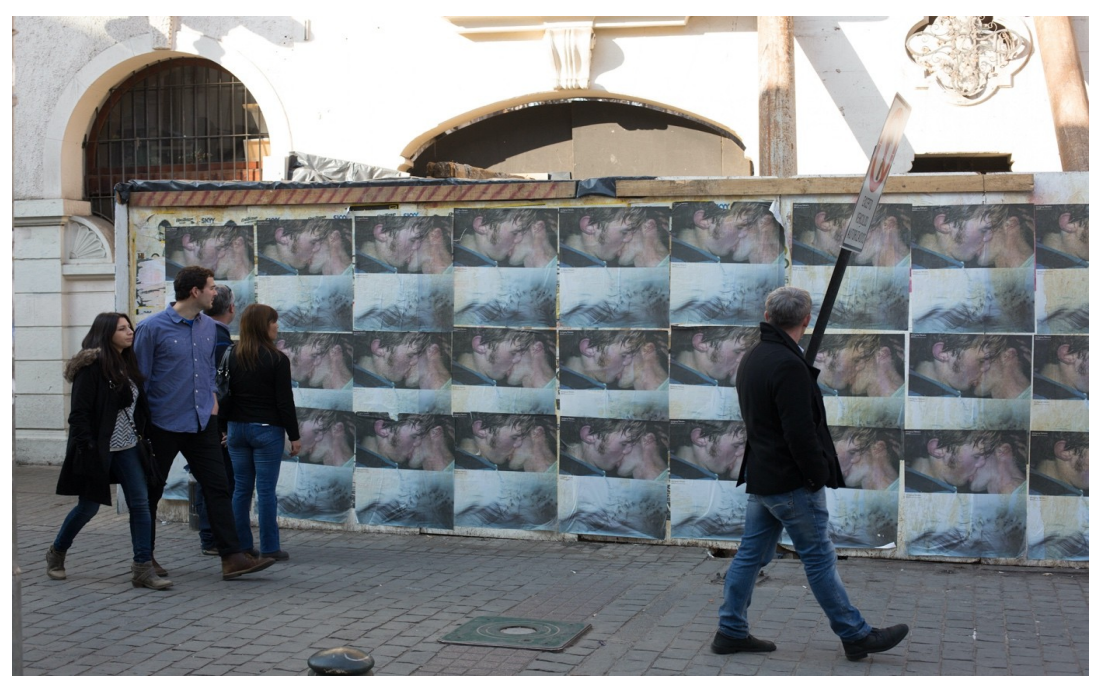
Fig. 2: Wolfgang Tillmans' photograph of a placarded wall in a street in Santiago on the occasion of his* exhibition Wolfgang Tillmans (07/18/13–10/20/13) at the Museo de Artes Visuales (MAVI). Each poster consists of a section of the analog photograph The Cock (Kiss) (2002) (top) and the camera-less photograph Ostgut Freischwimmer (right) (2004) (bottom).